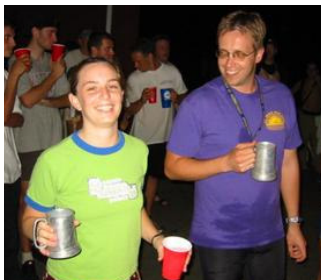
Wait, wait, check out my Betty Boop's.