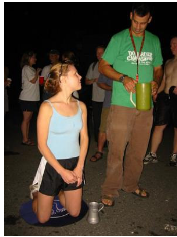
What's your favorite sexual position, little girl?