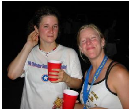
I'm some happy, I don't have to worry about staying thin anymore- let's go to Wendy's.