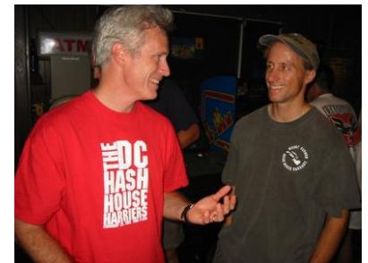
See, at the Men's Hash, we focus on man-to-man technique, like this...