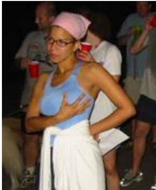
You can suck on my Betty Boop too.