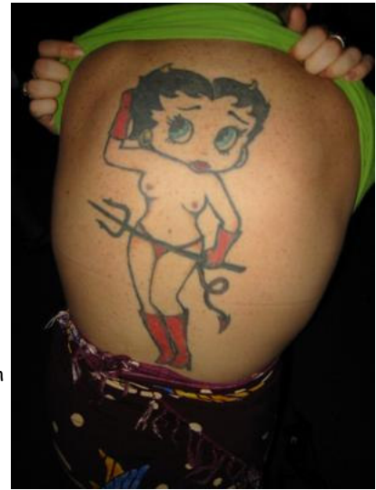
Well you can lick my Betty Boop, b*tch.