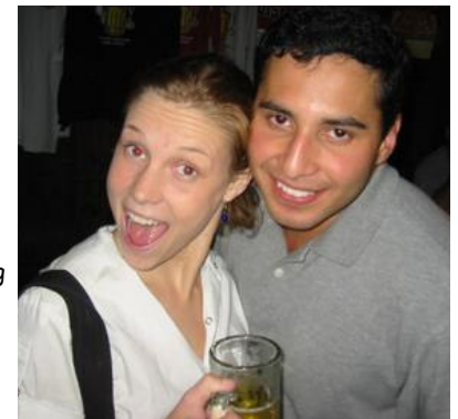
Guess who's going to get some Doucheburg tonight?