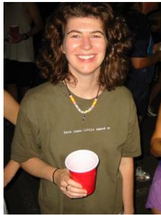
Get really close so you can read my shirt.