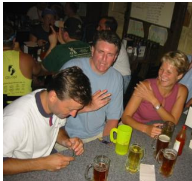
I want to kill myself...