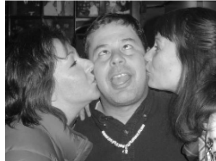
It's good to be the Hash Flash.

passing through plenty of scenic therapy, the wankers were defrosted enough to stop and name Wax On, Whacks Off as the Beer Bitch, since he had nothing else to do.