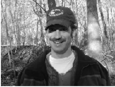
Why, WOWO? Why?