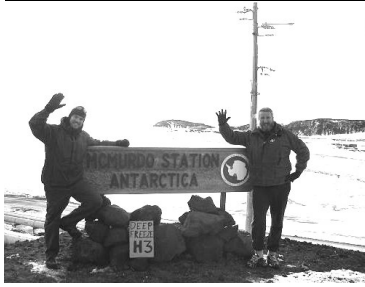
Where is in the world is Evil Jesus?