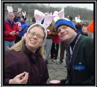
Thank for the ears, PIO!

"Has anyone seen my chocolate bunny," lamented PIO last Sunday. "I left it right here. It was the one with no ears." PIO was later seen happily munching on Chicks and Peeps.