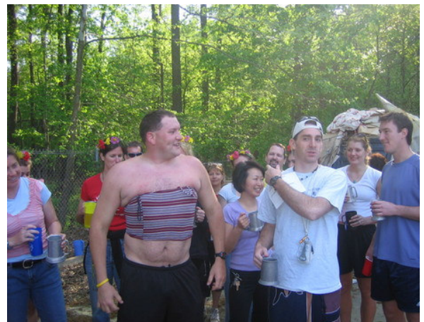
Pond Scrum in a Tube Top? Now THAT'S a violation.

Cock-A-Doodle-Do-Me had a vote of no confidence on trail after leading the pack off trail multiple times. "No really, it's over here somewhere" was heard multiple times.